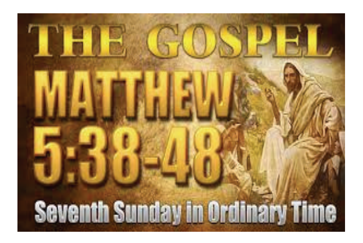
"Love your enemies and pray for those who persecute you!"

"Keys to Loving Relationships" is a ten week video-based program that all people (married, dating, or single) can use to develop the skills needed to have a truly meaningful relationship with a spouse, family member or friend. The program is offered in Hamilton at the Diocesan Chancery Office, 700 King Street West, on Thursday evenings from 7:00 to 9:00 pm March 26-June 4. Cost is $45.00. for more information or to register, call the Family Ministry Office at (905) 528-7988 ext. 2249.